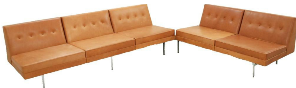
BY OS 21