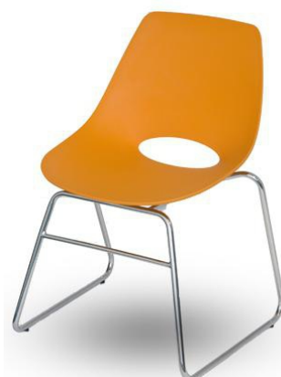
BY CC 23