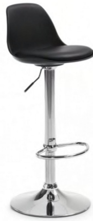
BY BC 03