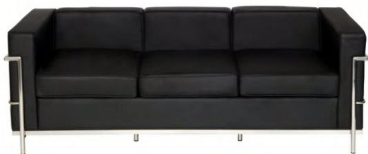
BY OS 13