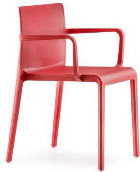
BY CC 36