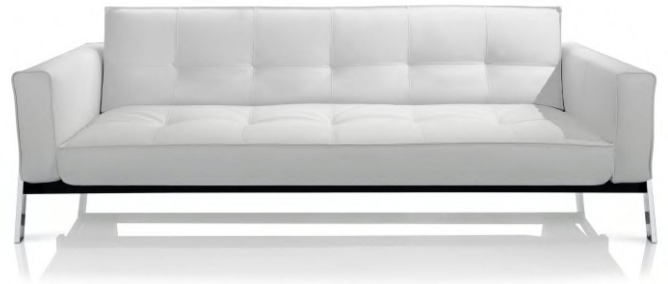
BY OS 06