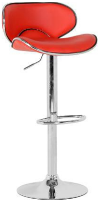
BY BC 01