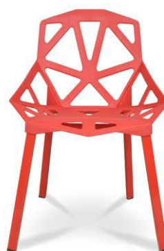
BY CC 15