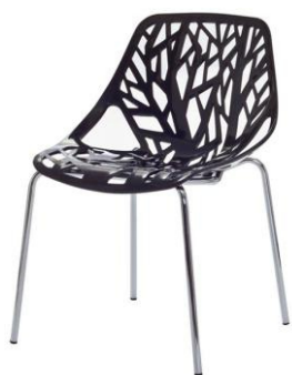
BY CC 14