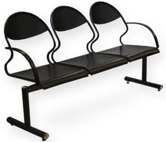
BY WC 04