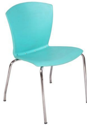
BY CC 39