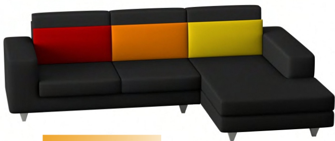
BY OS 11