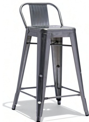
BY BC 10