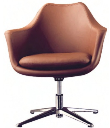
BY LC 09