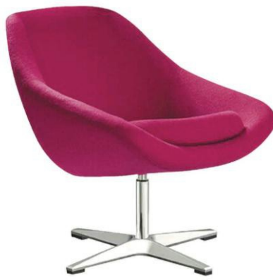
BY LC 02