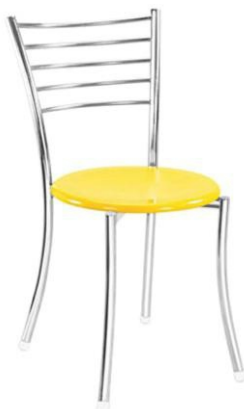
BY CC 42