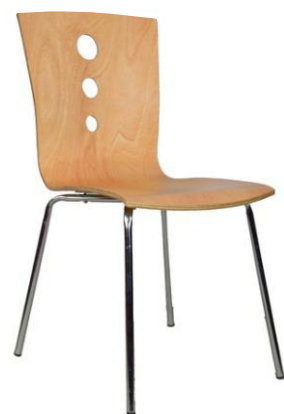
BY CC 44