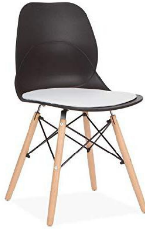
BY CC 03