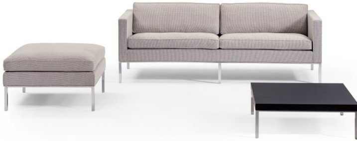
BY OS 03