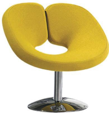
BY LC 07