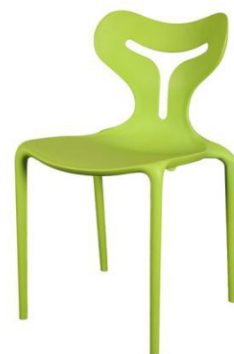
BY CC 28