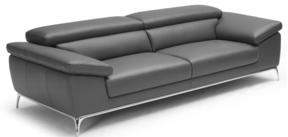
BY OS 08