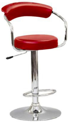
BY BC 05