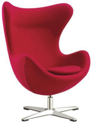
BY LC 01