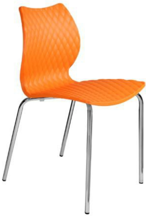
BY CC 37