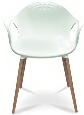
BY CC 04