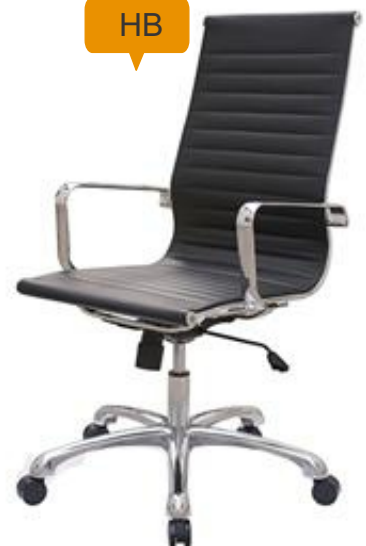
BY- COMBO 005