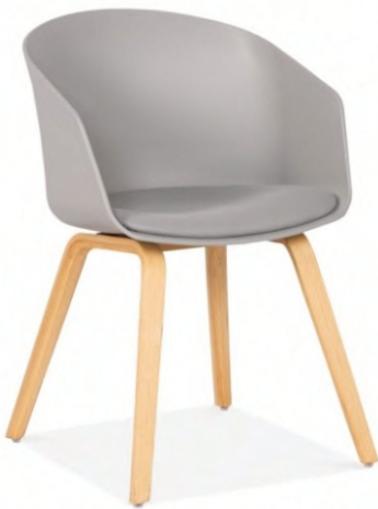
BY CC 09