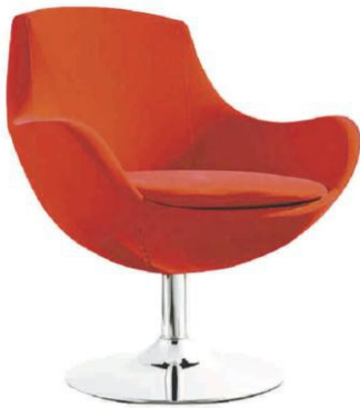
BY LC 04