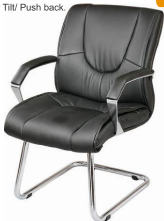
BY- COMBO 002