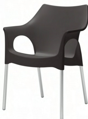
BY CC 26