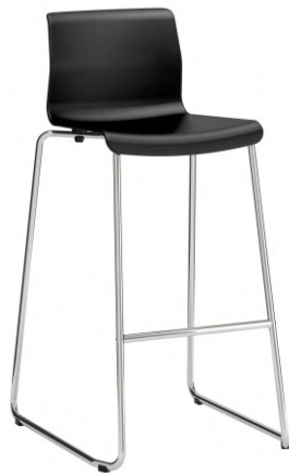
BY BC 06