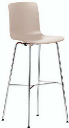
BY BC 09