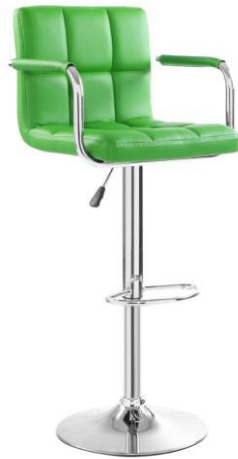
BY BC 02