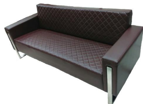
BY OS 20