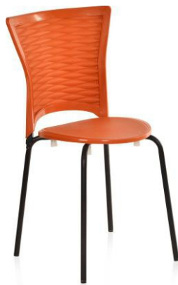
BY CC 34