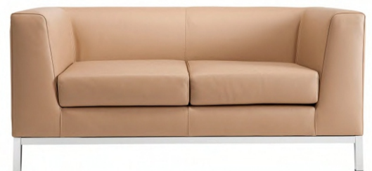
BY OS 10