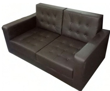
BY OS 18