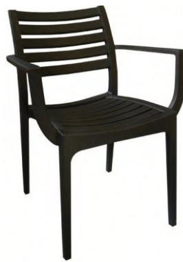
BY CC 35