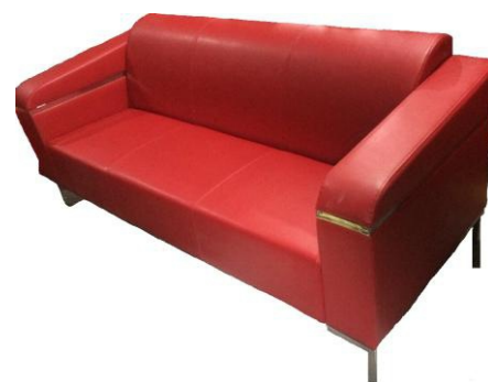
BY OS 17