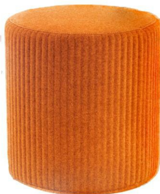
BY LC 11