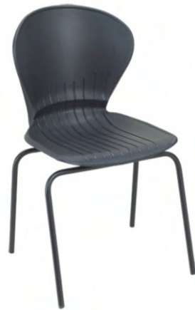
BY CC 38