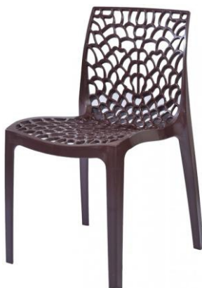
BY CC 18