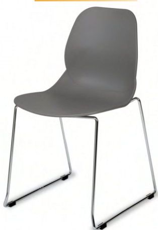
BY CC 21