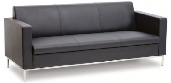
BY OS 02