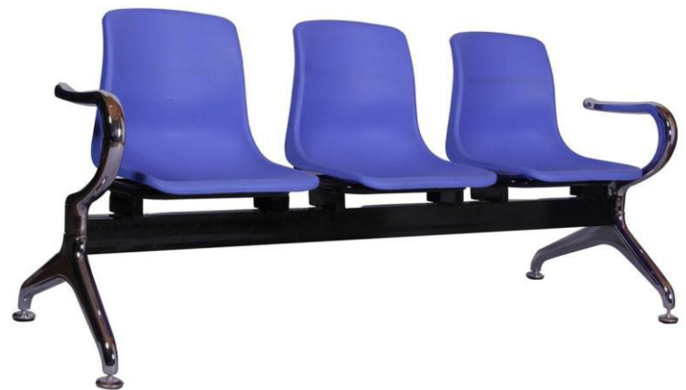
BY WC 06