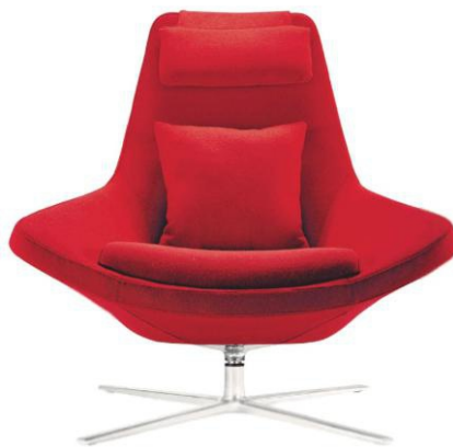
BY LC 08