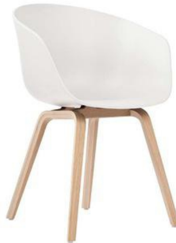
BY CC 11