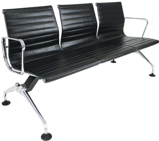
BY WC 03