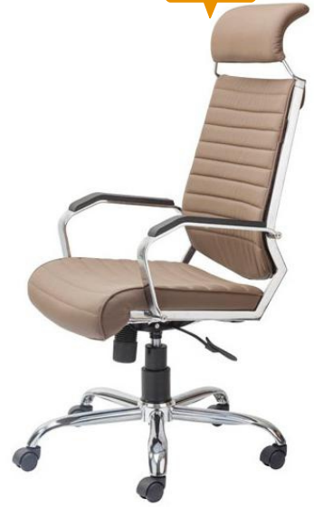
BY- COMBO 007