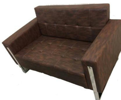
BY OS 19