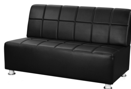
BY OS 22