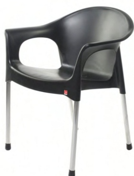
BY CC 25