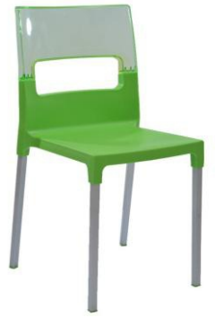
BY CC 32