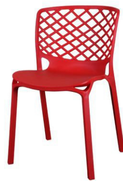
BY CC 16