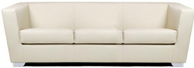
BY OS 05