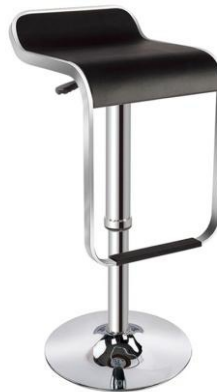
BY BC 11