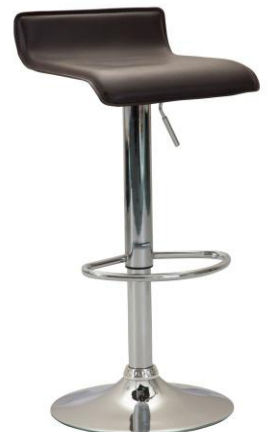
BY BC 12