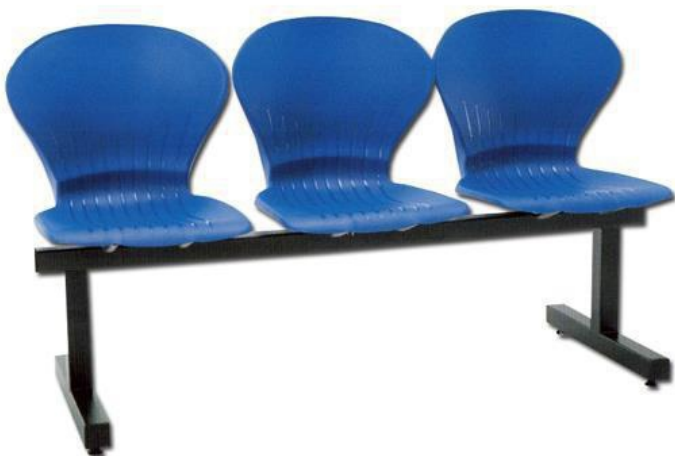
BY WC 05