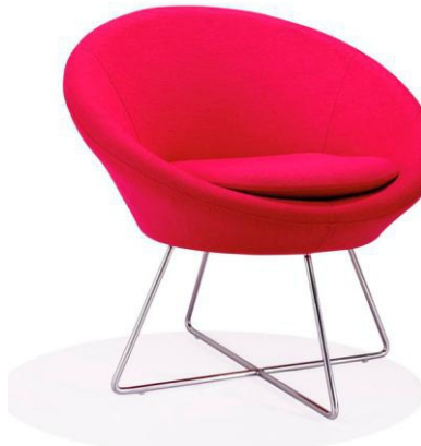
BY LC 05