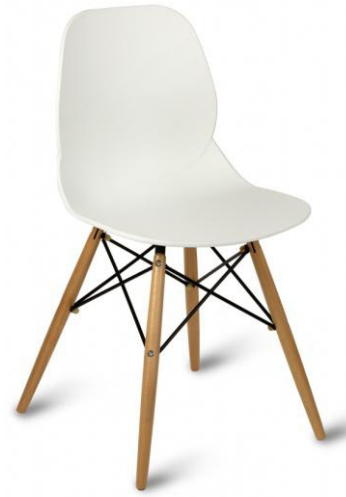
BY CC 08