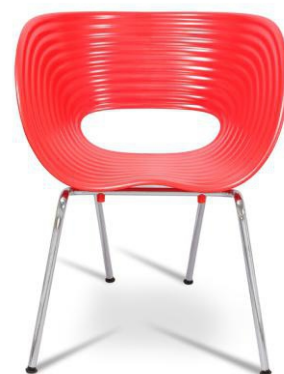
BY CC 24