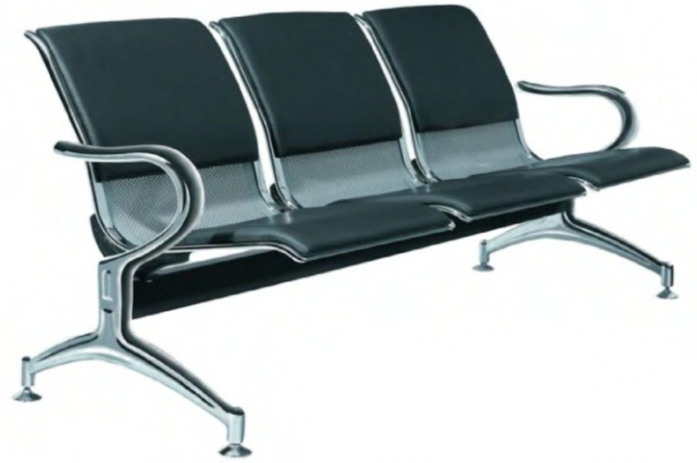
BY WC 02