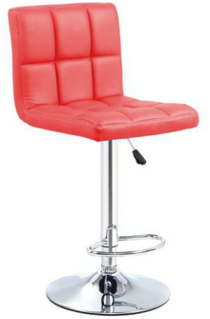
BY BC 04