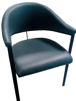
BY LC 10