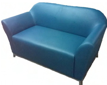
BY OS 16