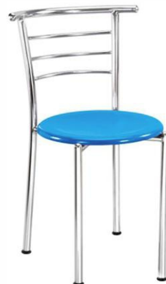
BY CC 43