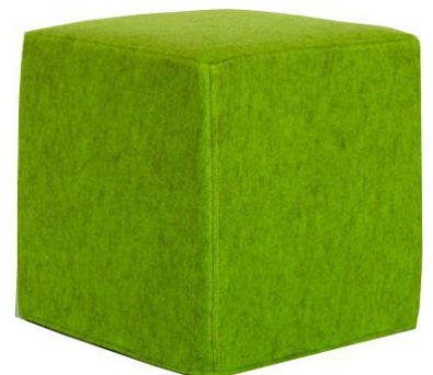
BY LC 12