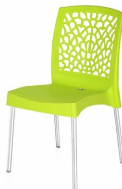
BY CC 19