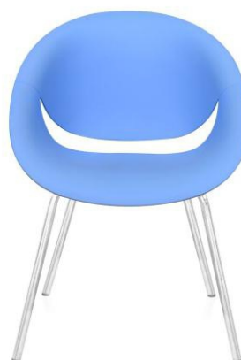
BY CC 27