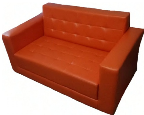
BY OS 15