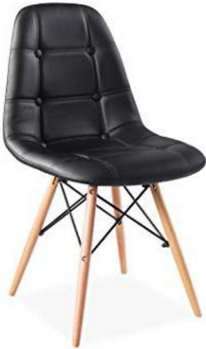
BY CC 05