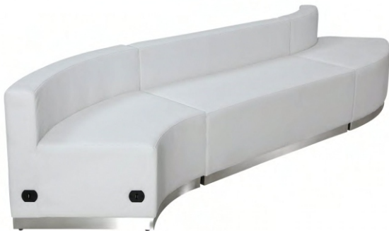
BY OS 07