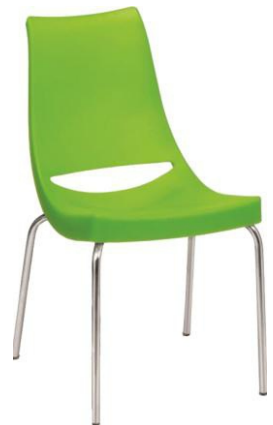
BY CC 40