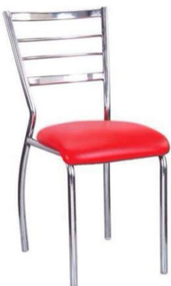
BY CC 41