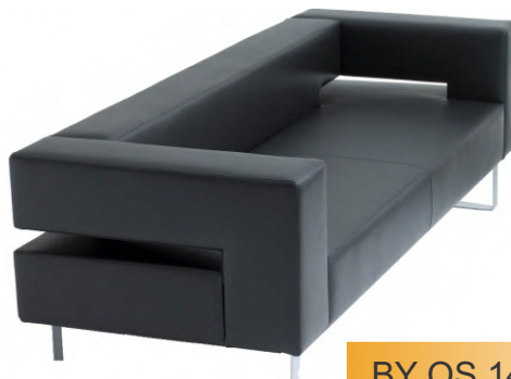
BY OS 14