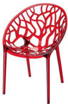
BY CC 13