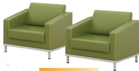
BY OS 12