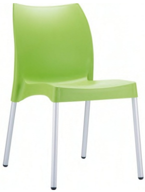
BY CC 29