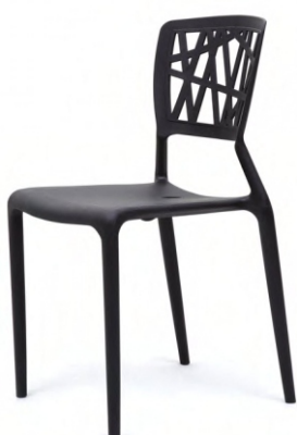
BY CC 17