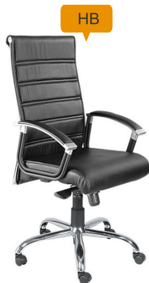
BY- COMBO 011