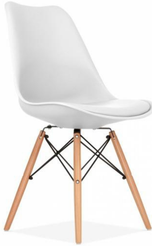
BY CC 06