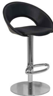
BY BC 07