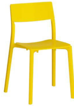
BY CC 31