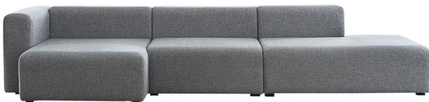
BY OS 09