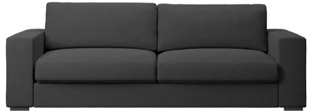
BY OS 04