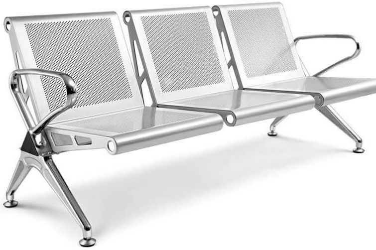
BY WC 01