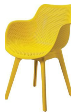
BY CC 20