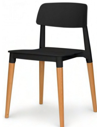
BY CC 12