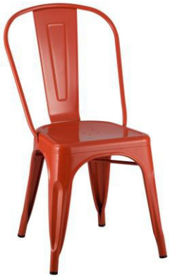
BY CC 33