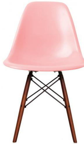
BY CC 07