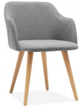
BY LC 06