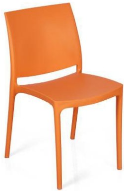
BY CC 30