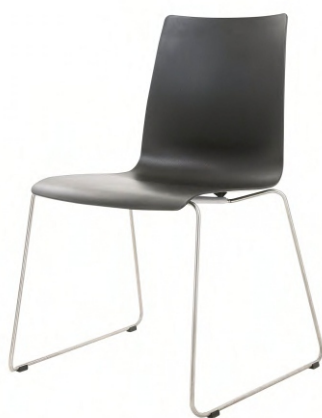
BY CC 22