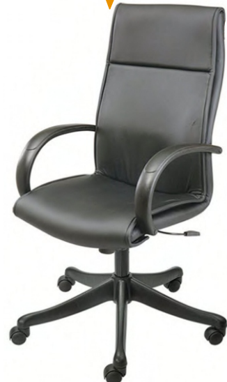
BY- COMBO 009