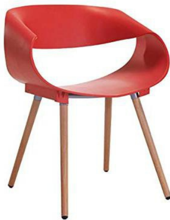
BY CC 10