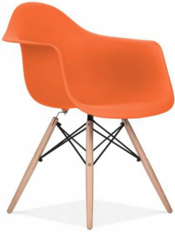
BY CC 01