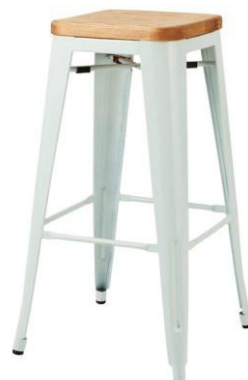
BY BC 14