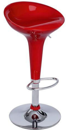
BY BC 08