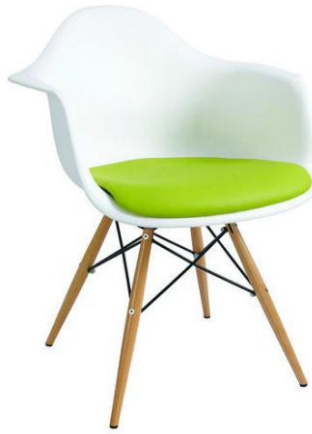
BY CC 02