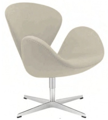
BY LC 03