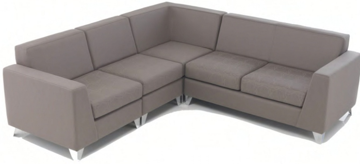
BY OS 01